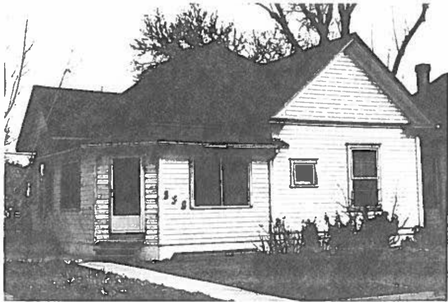
838 White Ave. (front), Grand Junction, Mesa Co, CO 2945-144-04-011 02/29/1996 Roll 32 Frame 12 View S Dir N/NW SME 8208