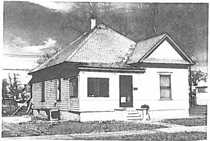
760 South Ave., Grand Junction, Mesa Co, CO 2945-144-43-009 02/05/1996 Roll 23 Frame 2 View S Dir NE