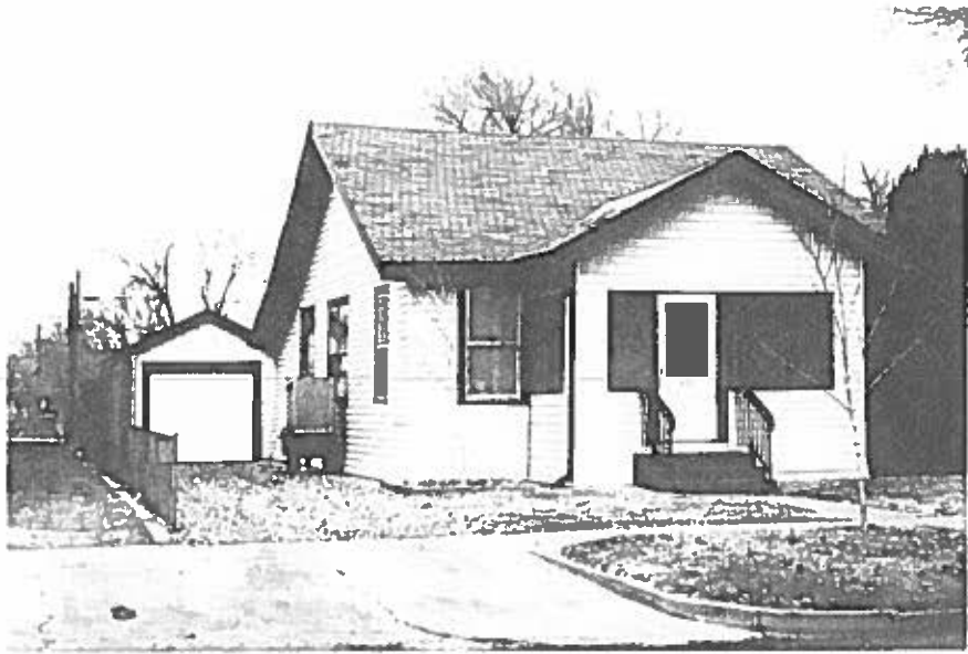
820 Hill Ave. , Grand Junction, Mesa Co, CO 2945-141-15-012 1/29/1996 Roll 19 Frame 19 View S Dir N/NE 5ME7946