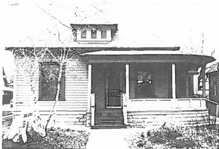
844 Grand Ave., Grand Junction, Mesa Co, CO 2945-141-39-012 1/30/1996 Roll 22 Frame 09 View S Dir N 5ME7926