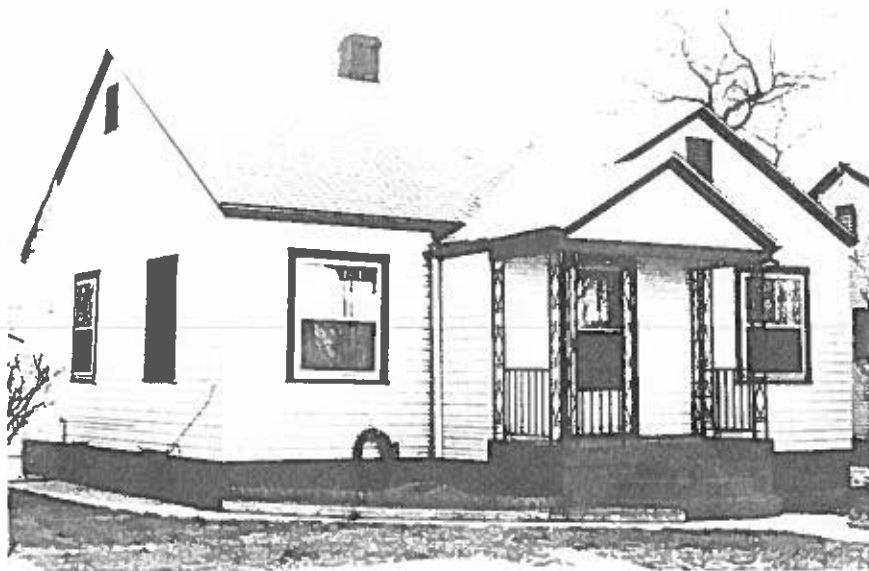
227 Belford Ave. , Grand Junction, Mesa Co, CO 2945-142-11-004 02/07/1996 Roll 29 Frame 6 View N Dir S/SW SMF 8315