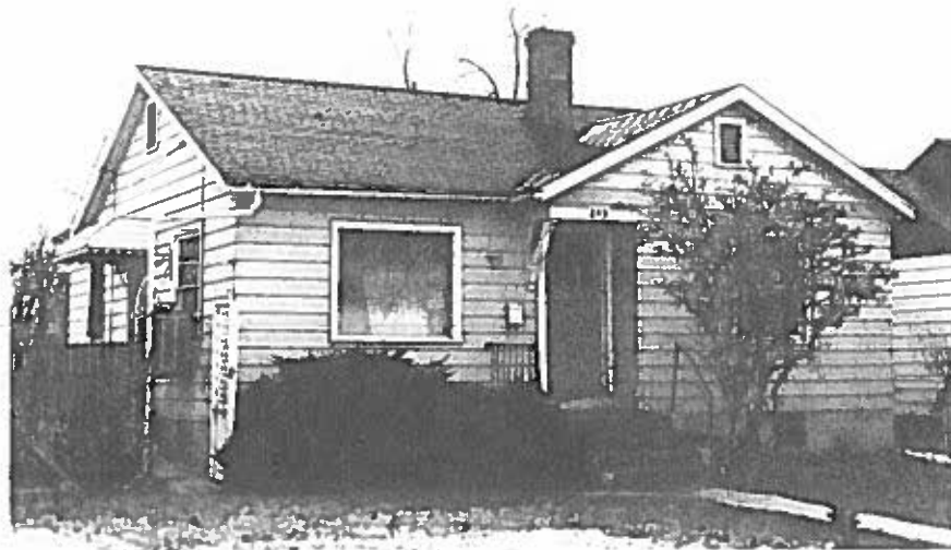
245 Belford Ave., Grand Junction, Mesa Co, CO 2945-142-11-006 02/07/1996 Roll 29 Frame 9 View N Dir S/SW SME8314