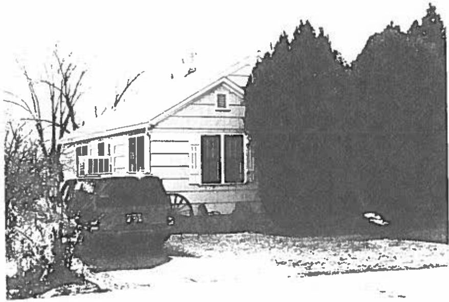
311 Belford Ave. , Grand Junction, Mesa Co, CO 2945-142-10-002 02/07/1996 Roll 29 Frame 12 View N Dir SW S m E 8319