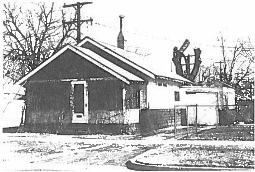
818 N. 3rd St., Grand Junction, Mesa Co, CO 2945-142-15-016 02/06/1996 Roll 27 Frame 10 View W Dir NE SME 8320