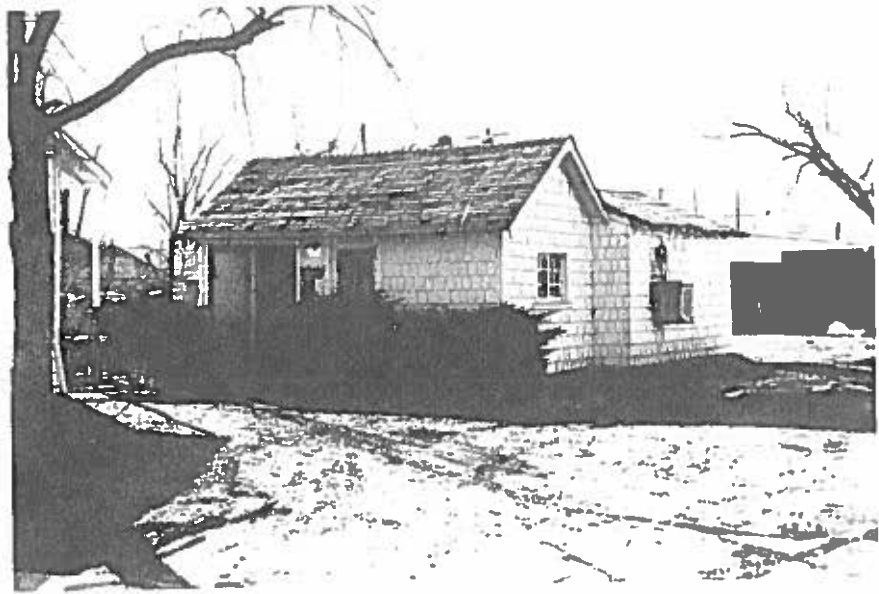
927 N. 2nd St., Grand Junction, Mesa Co, CO 2945-142-12-016 02/06/1996 Roll 28 Frame 25 View E Dir SW 5mE 8323