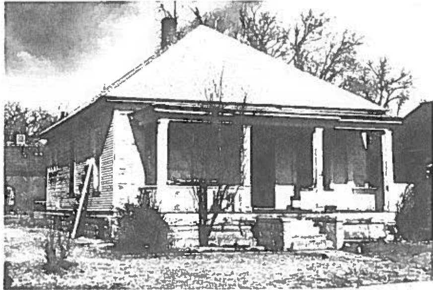
212 Hill Ave. , Grand Junction, Mesa Co, CO 2945-142-14-015 02/07/1996 Roll 29 Frame 01 View S Dir NE 5mE8324