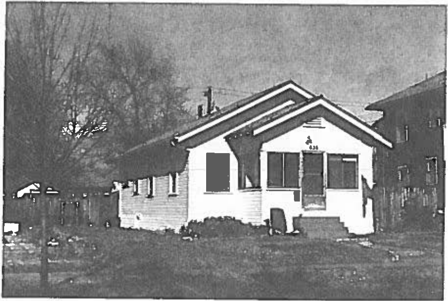
626 Hill Ave. , Grand Junction, Mesa Co, CO 2945-142-18-008 02/06/1996 Roll 27 Frame 16 View S Dir N/NE SME 8328