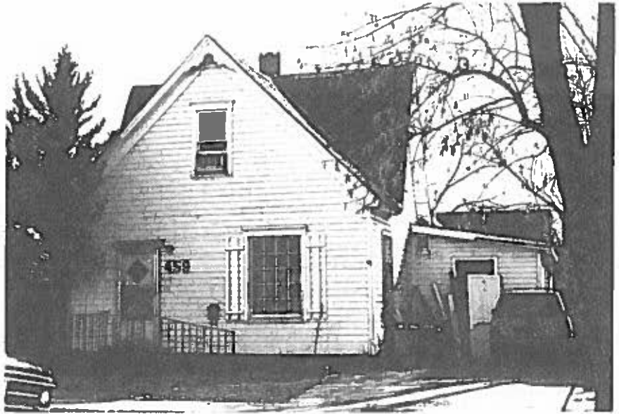
459 Belford Ave., Grand Junction, Mesa Co, CO 2945-142-09-006 02/07/1996 Roll 29 Frame 25 View N Dir S/SE SME 8334