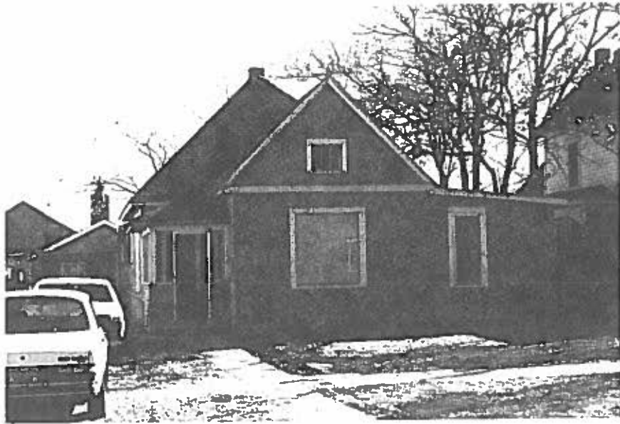
321 Ouray Ave., Grand Junction, Mesa Co, CO 2945-142-39-003 03/21/1996 Roll 39 Frame 5 View N Dir S/SW SME 8336