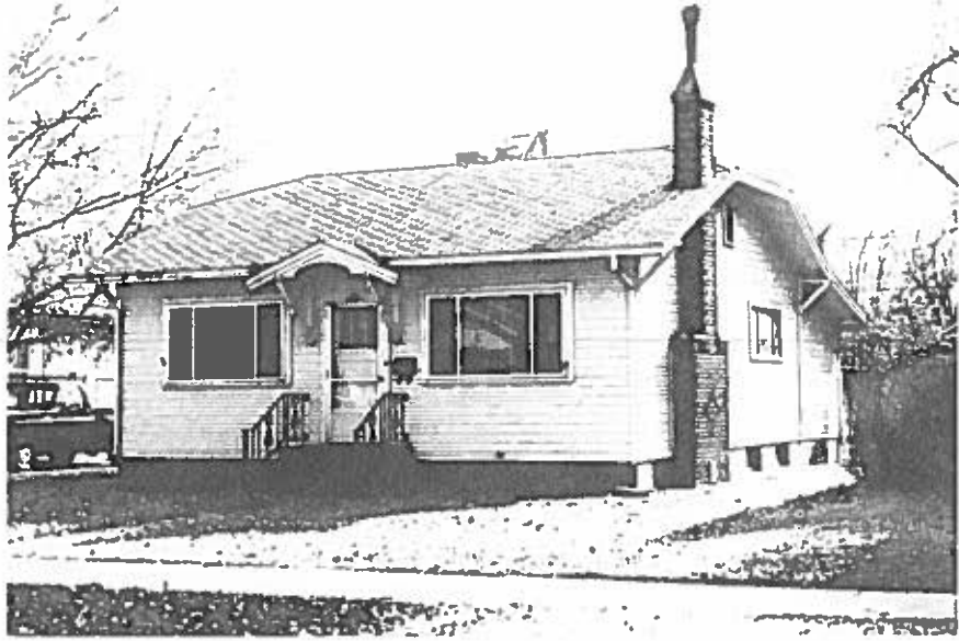
611 Hill Ave. , Grand Junction, Mesa Co, CO 2945-142-19-002 02/06/1996 Roll 27 Frame 15 View N Dir S/SE SME 8343