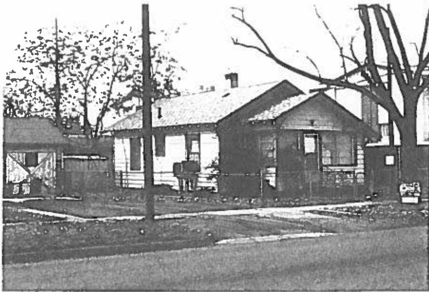
515 N. 5th St., Grand Junction, Mesa Co, CO 2945-142-33-010 02/05/1996 Roll 24 Frame 10 View E Dir NW SME 8348