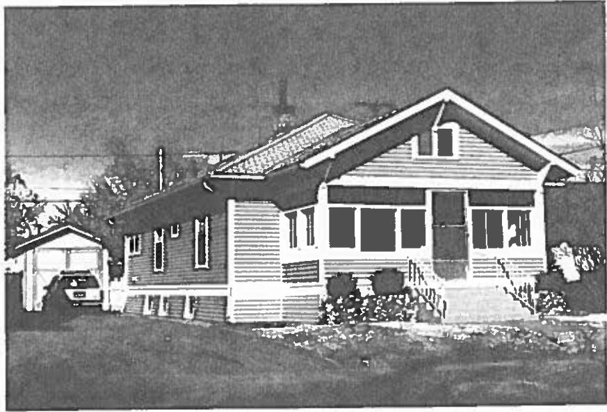
1060 Hill Ave. , Grand Junction, Mesa Co, CO 2945-141-17-016 02/05/1996 Roll 23 Frame 21 View S Dir N/NW SME 8351