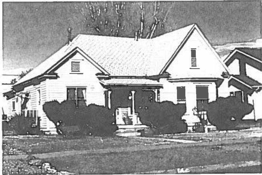
1138 Hill Ave. , Grand Junction, Mesa Co, CO 2945-141-18-005 02/05/1996 Roll 23 Frame 25 View S Dir N/NE SmE 8353