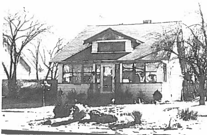
747 Hill Ave. , Grand Junction, Mesa Co, CO 2945-141-23-005 02/05/1996 Roll 23 Frame 16 View N Dir S/SE SME8360