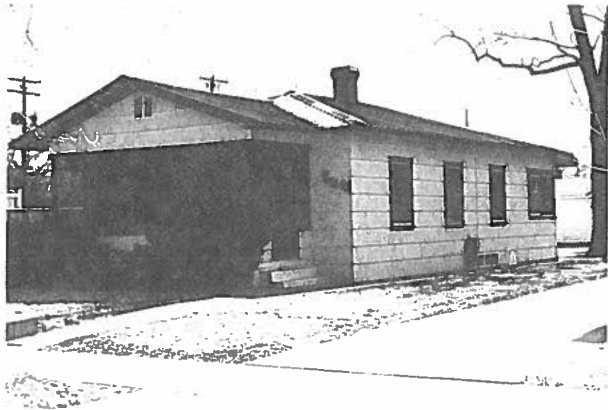
1143 Hill Ave. , Grand Junction, Mesa Co, CO 2945-141-19-006 02/29/1996 Roll 33 Frame 2 View N Dir S/SE SME 836)