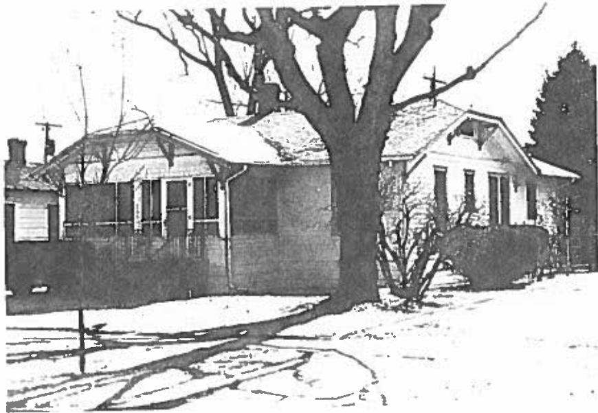
1135 Hill Ave. , Grand Junction, Mesa Co, CO 2945-141-19-005 02/29/1996 Roll 33 Frame 0 View N Dir S/SE SME 8379