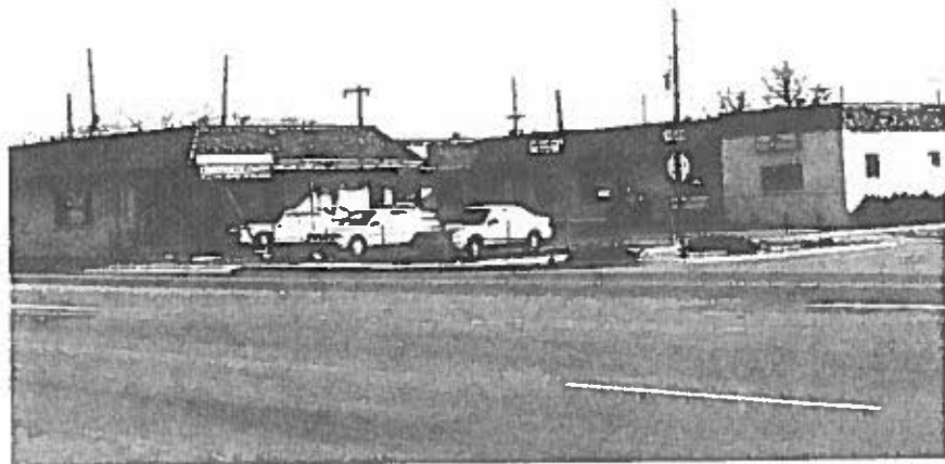
609 North Ave., Grand Junction, Mesa Co, CO 2945-142-06-011 02/07/1996 Roll 30 Frame 11 View W Dir SE 5ME8461