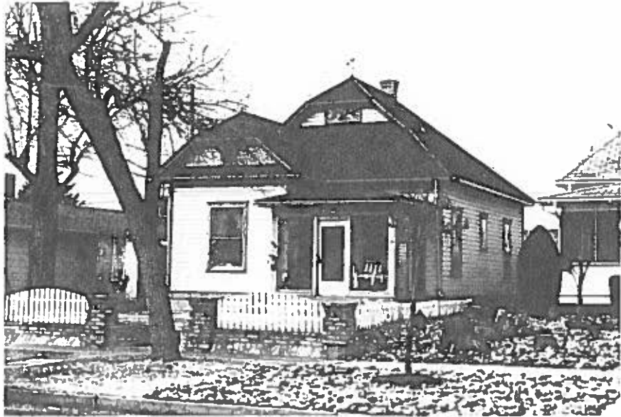
614 Belford Ave. , Grand Junction, Mesa Co, CO 2945-142-06-009 02/07/1996 Roll 30 Frame 6 View S Dir N/NW SME 8432