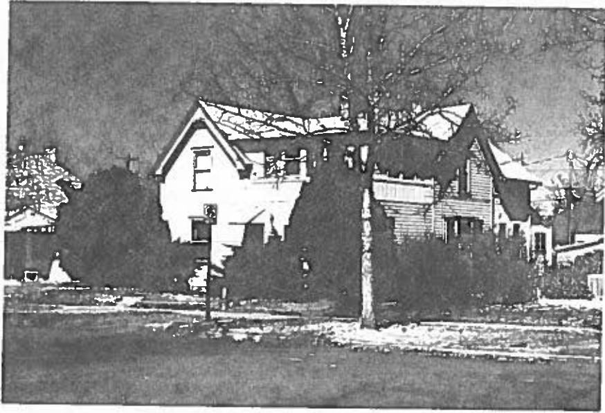
450 Hill Ave. , Grand Junction, Mesa Co, CO 2945-142-16-010 03/11/1996 Roll 37 Frame 22 View S Dir NW 5ME8454