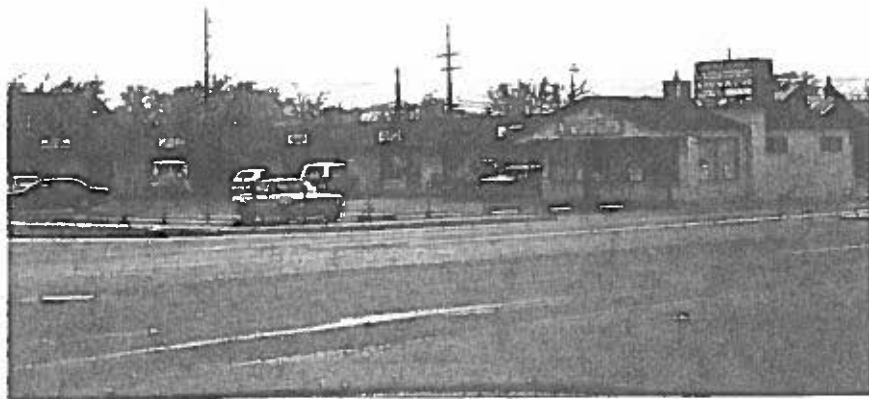
555 North Ave. , Grand Junction, Mesa Co, CO 2945-142-05-008 02/07/1996 Roll 30 Frame 10 View E Dir SW SME8460