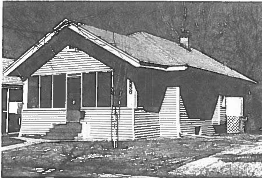
556 Hill Ave. , Grand Junction, Mesa Co, CO 2945-142-17-012 03/11/1996 Roll 37 Frame 18 View S Dir N/NW SME8472