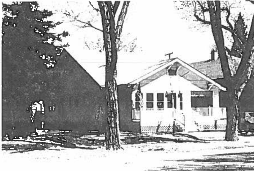
1026 Main Ave., Grand Junction, Mesa Co, CO 2945-144-14-012 03/08/1996 Roll 35 Frame 4 View S Dir NE SME8474