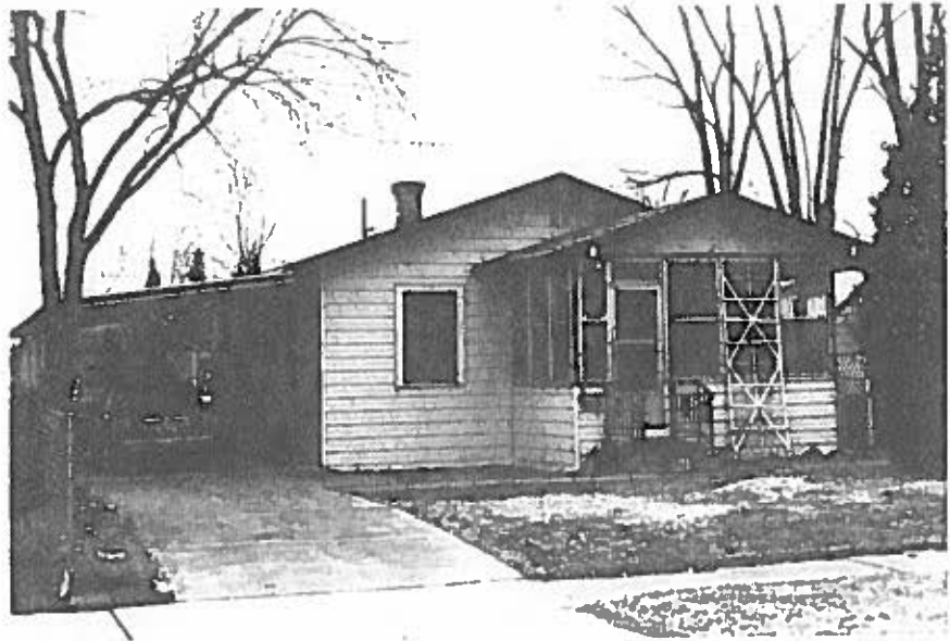
911 Teller Ave. , Grand Junction, Mesa Co, CO 2945-141-16-002 02/07/1996 Roll 30 Frame 18 View N Dir S/SW SME0480