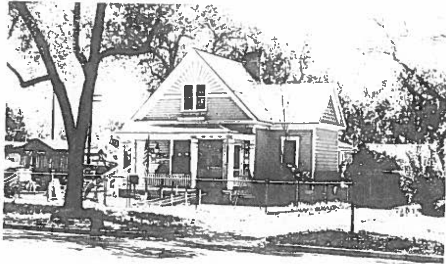
1159 Grand Ave., Grand Junction, Mesa Co, CO 2945-144-01-007 04/30/1996 Roll 43 Frame 16 View N Dir SW • 5mE8481