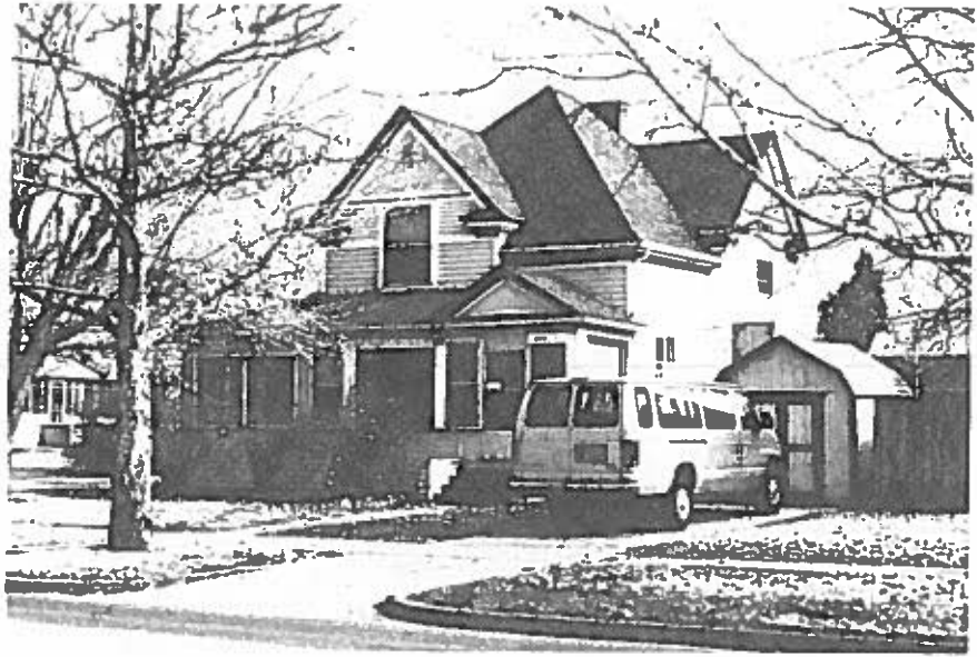
738 N. 5th St., Grand Junction, Mesa Co, CO 2945-142-20-978 02/06/1996 Roll 26 Frame 4 View W Dir NE SME8487