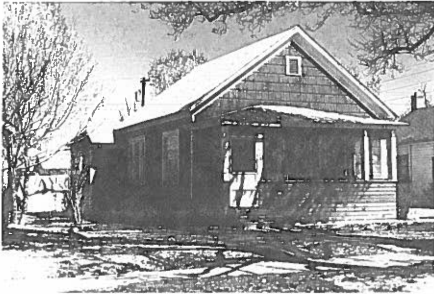
620 Gunnison Ave., Grand Junction, Mesa Co, CO 2945-142-19-008 03/11/1996 Roll 37 Frame 12 View S Dir NE SMEB492