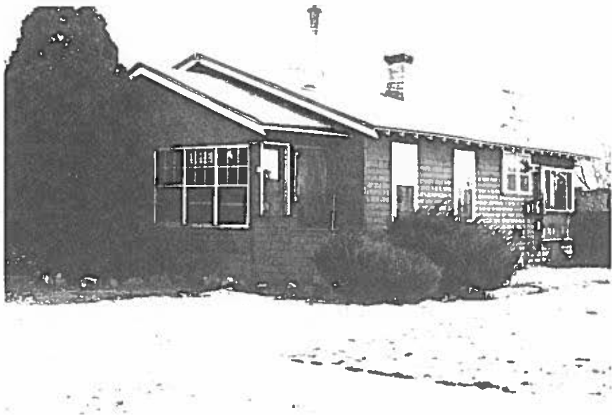
301 Hill Ave. , Grand Junction, Mesa Co, CO 2945-142-22-001 02/06/1996 Roll 27 Frame 6 View N Dir SE 5ME8498