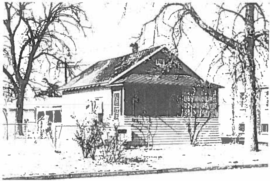
719 N. 4th St., Grand Junction, Mesa Co, CO 2945-142-22-008 02/06/1996 Roll 26 Frame 13 View E Dir NW SME 8500