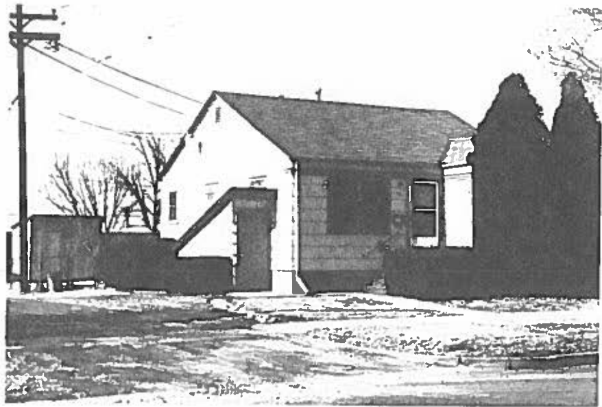
621 N. 2nd St., Grand Junction, Mesa Co, CO 2945-142-25-007 02/06/1996 Roll 27 Frame 2 View E Dir NW SME8503