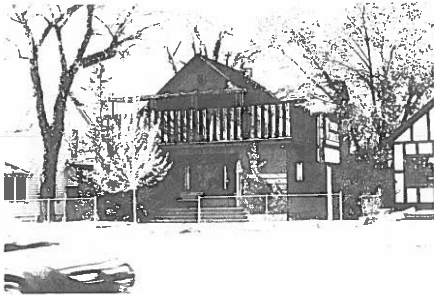
636 Grand Ave. , Grand Junction, Mesa Co, CO 2945-142-42-007 04/29/1996 Roll 43 Frame 8 View S Dir N/NE • SME85/6