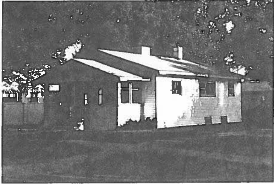
1260 Rood Ave., Grand Junction, Mesa Co, CO 2945-133-05-015 05/14/1996 Roll 44 Frame 15 View S Dir NW SME8517