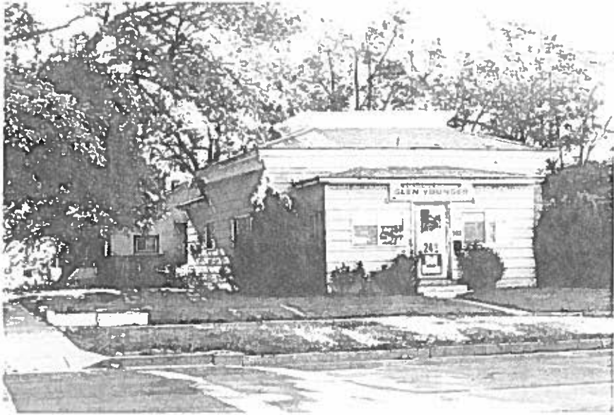
302 S. 7th St., Grand Junction, Mesa Co, CO 2945-144-32-004 05/14/1996 Roll 45 Frame 4 View W Dir SE SME8524