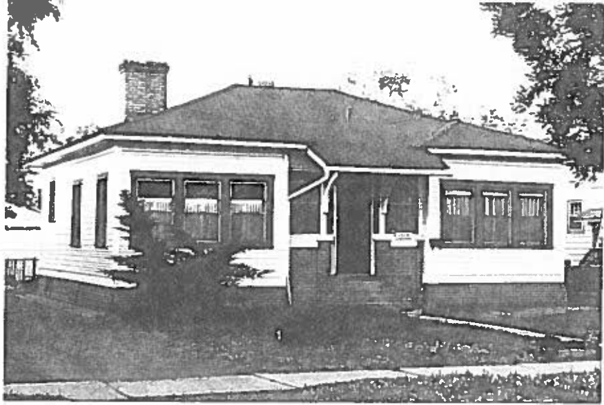
1319 Ouray Ave., Grand Junction, Mesa Co, CO 2945-132-21-003 05/14/1996 Roll 44 Frame 3 View N Dir SW SME 0531