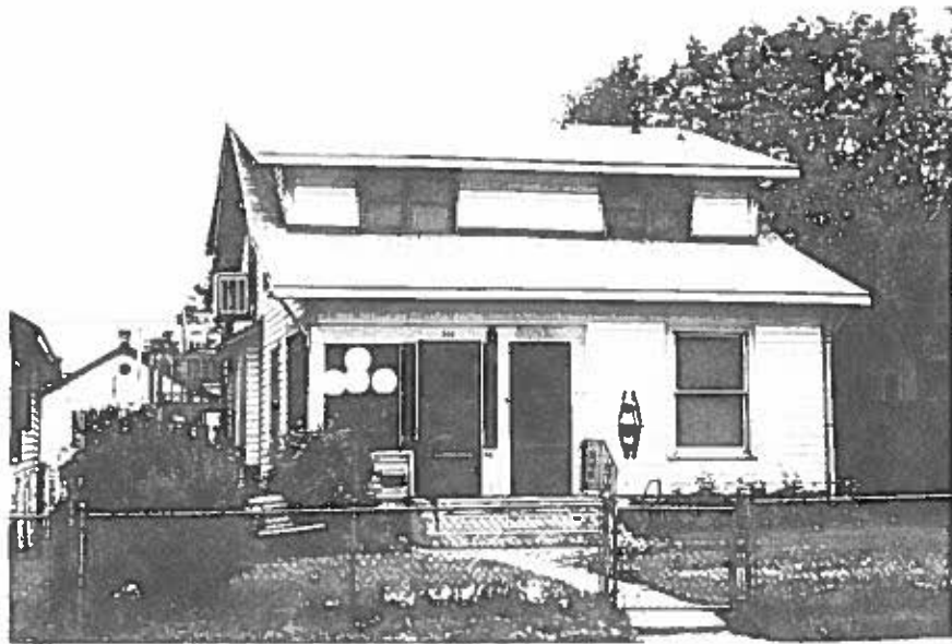
541 Teller Ave. , Grand Junction, Mesa Co, CO 2945-142-17-007 05/24/1996 Roll 47 Frame 4 View N Dir S/SW 5ME 8541