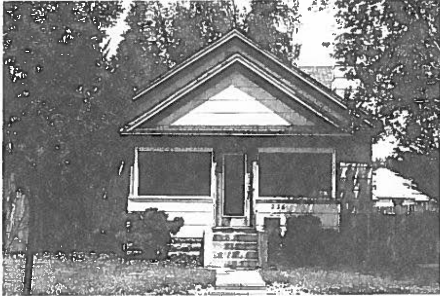
236 Hill Ave. , Grand Junction, Mesa Co, CO 2945-142-14-012 05/14/1996 Roll 45 Frame 25 View S Dir N 5mE8552