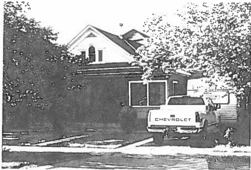
747 Colorado Ave. , Grand Junction, Mesa Co, CO 2945-144-29-010 05/14/1996 Roll 44 Frame 24 View N Dir SE 5ME8568