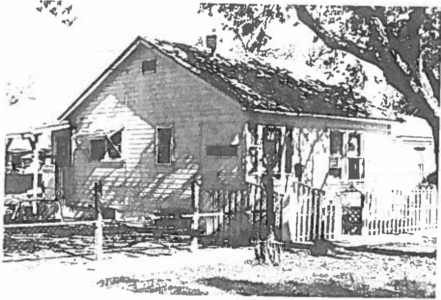
415 S. 3rd St., Grand Junction, Mesa Co, CO 2945-143-37-010 04/29/1996 Roll 40 Frame 6 View E Dir NW • SME9587