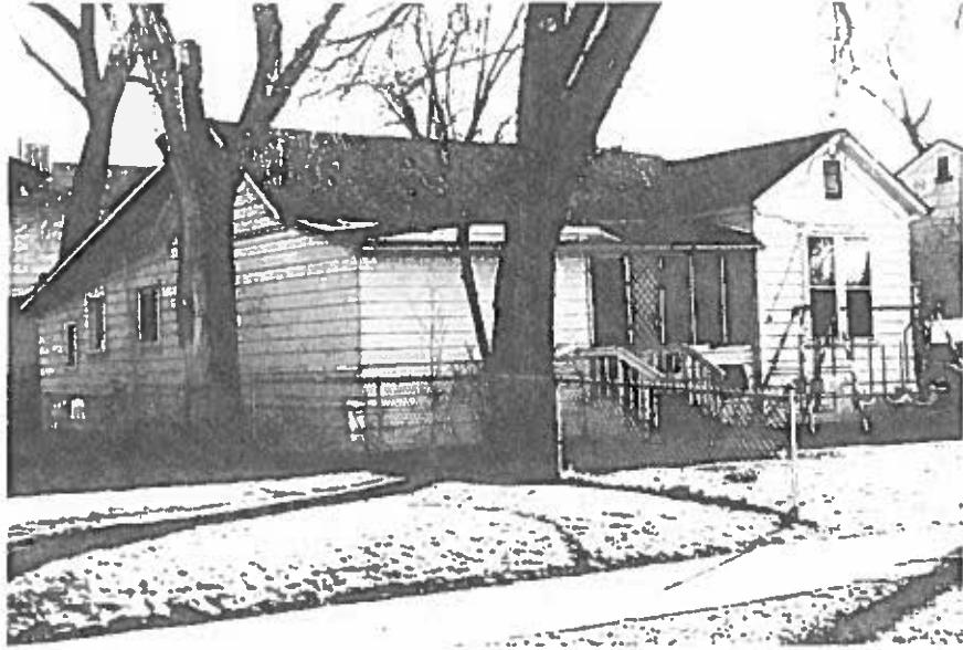
321 Gunnison Ave., Grand Junction, Mesa Co, CO 2945-142-27-003 02/28/1996 Roll 31 Frame 16 View N Dir SW SME 8597