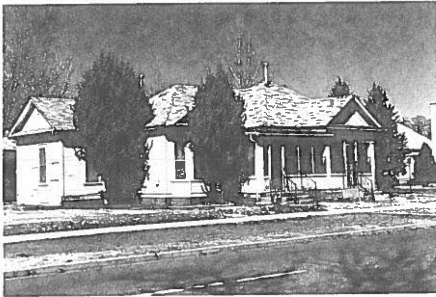
639 N. 4th St., Grand Junction, Mesa Co, CO 2945-142-27-007 03/11/1996 Roll 37 Frame 10 View E Dir NW 5ME8602