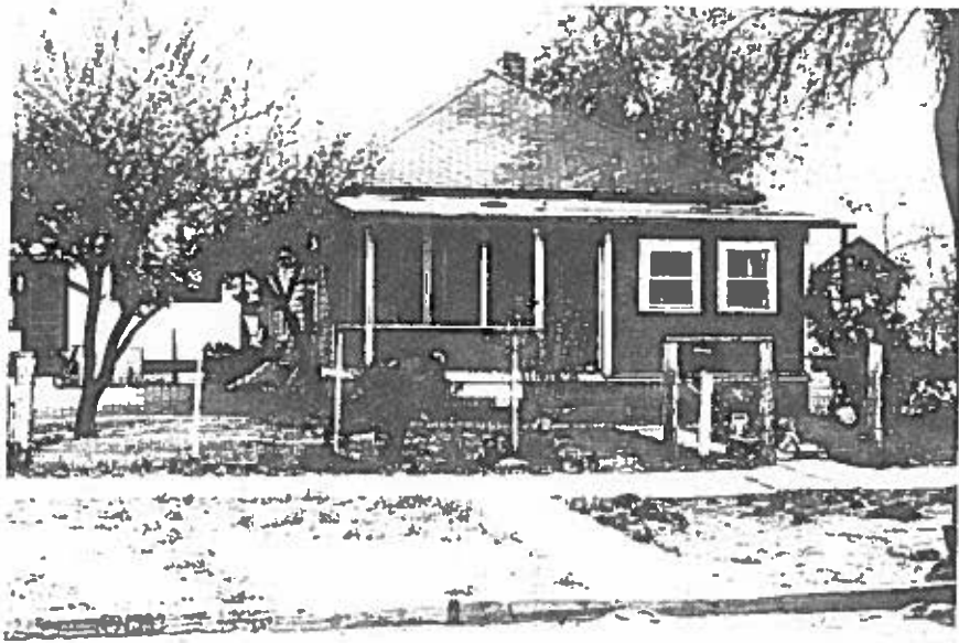
239 White Ave. , Grand Junction, Mesa Co, CO 2945-143-11-015 04/29/1996 Roll 42 Frame 22 View N Dir S/SW • SME 2625