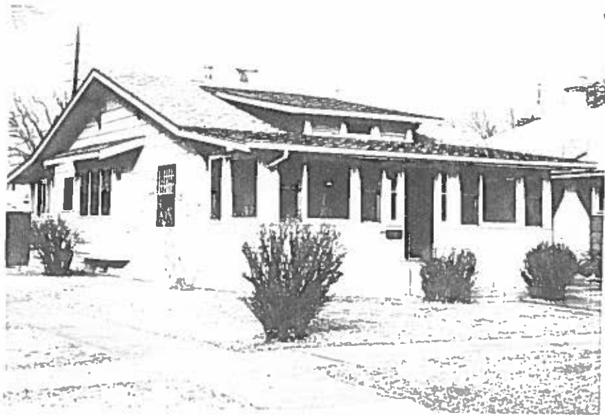
1002 Chipeta Ave., Grand Junction, Mesa Co, CO 2945-141-29-008 1/29/1996 Roll 20 Frame 03 View S Dir NE 5ME7865