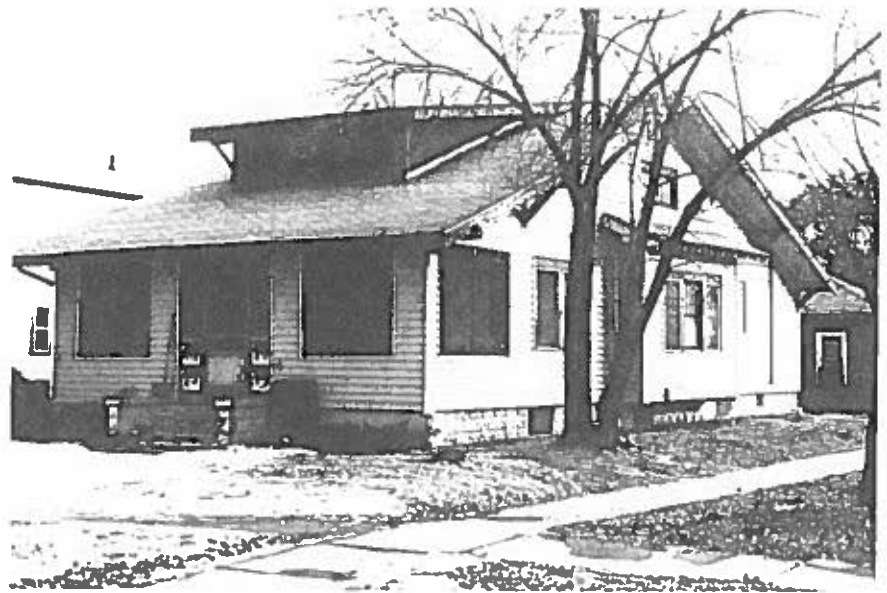
801 Chipeta Ave. , Grand Junction, Mesa Co, CO 2945-141-34-001 1/29/1996 Roll 20 Frame 16 View N Dir SW 5ME7886