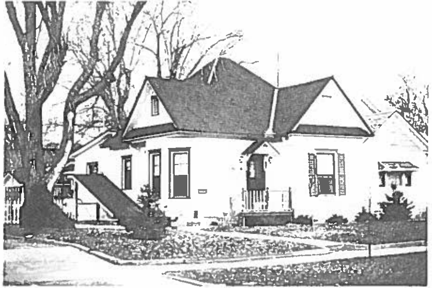
1028 Ouray Ave., Grand Junction, Mesa Co, CO 2945-141-32-012 1/29/1996 Roll 21 Frame 09 View S Dir NE SME7889