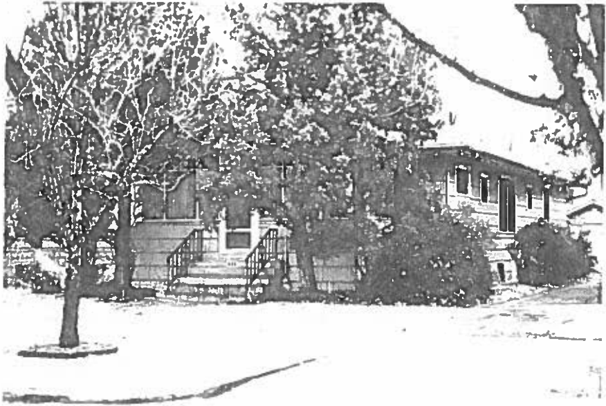
835 Ouray Ave., Grand Junction, Mesa Co, CO 2945-141-39-005 1/29/1996 Roll 22 Frame 04 View N Dir S/SE SME7905