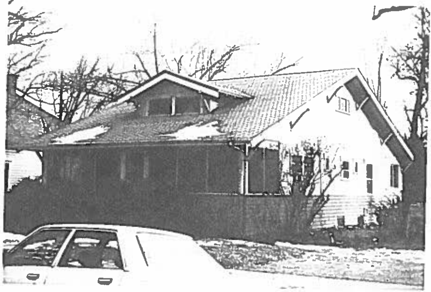
919 Chipeta Ave. , Grand Junction, Mesa Co, CO 2945-141-33-003 1/29/1996 Roll 20 Frame 25 View N Dir SE SME7911