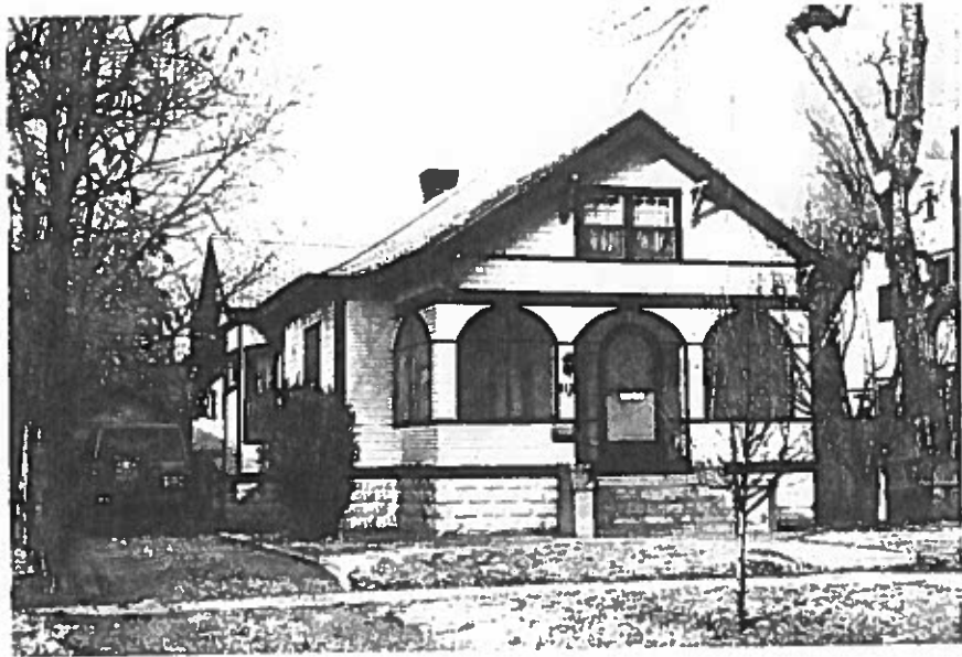
812 Chipeta Ave. , Grand Junction, Mesa Co, CO 2945-141-27-011 1/29/1996 Roll 20 Frame 17 View S Dir N/NE 5ME7916